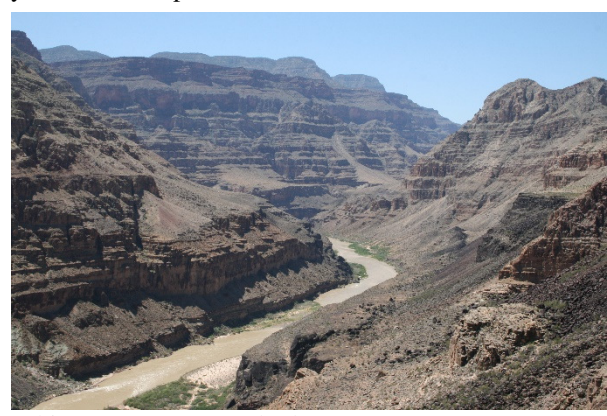
Whitmore canyon overlook

We then headed out for Whitmore overlook, one of the most popular views on the edge of Grand Canyon. The road starts out graded and gradually turns into a trail, at a Y in the trail we took the right fork instead of the left fork, which led us down a series of steep switchbacks into Parashant canyon and across a plateau toward a Copper Mine. Upon realizing we had made a wrong turn, we made a U turn and went back up the narrow canyon and the switchbacks and camped at the top in a clearing. We enjoyed out first night on the trail. Lesson learned: when selecting trails on Google Earth they may not exist on your GPS's maps.