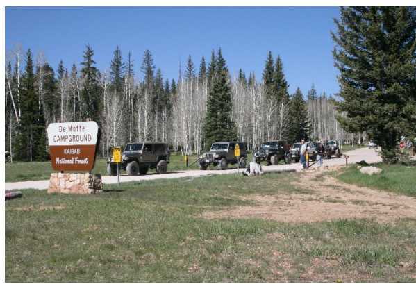
Heading to camp

On day 3 went to the city of Kanab, Utah, the gateway to southern Utah and Zion. We stocked up with provisions, ate lunch, and took highway 89A south for our camp site at DeMotte, but along the way we had to stop at Jacobs Lake Lodge for their World Famous Cookies. Their reputations did not disappoint. Tim the DeMotte camp site host and Ray's best friend escorted us to our camp sites where we set up base camp for the next 3 nights. DeMotte has all the modern conveniences' including pit toilets, fresh water, fire rings and picnic tables. After camp was setup at DeMotte a few of the dirty campers headed to the National Park campground for a hot shower. There is also a gas station, general store and lodge with restaurant at DeMotte.