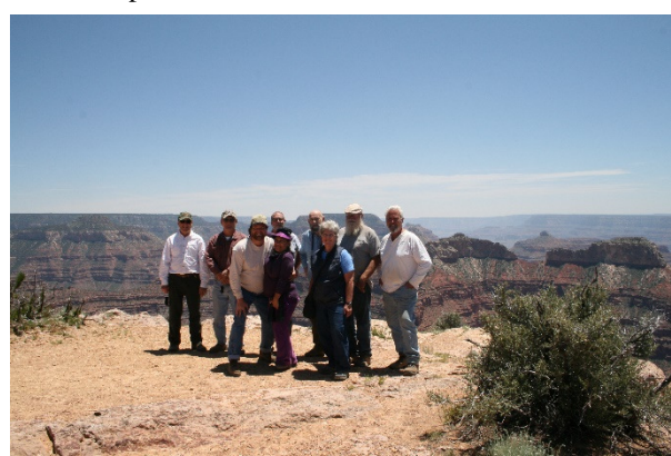
Point Sublime overlook

Point Sublime may be the best views of the trip including a 320 degree view of the Grand Canyon. The view was so wide, the only way to get the whole view was to put my camera into video mode and scan all 320 degrees. There is a small picnic area were we had lunch with nice views.