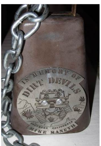
Old Logo Green