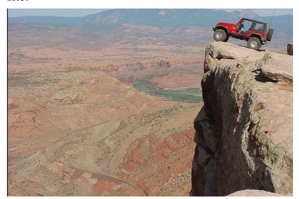
Enjoying the views. Ray Kleinhuizen

The Grand Canyon north rim run was an awesome adventure fun easy trails and beautiful views. The complete run write up is in this newsletter and on our web site.