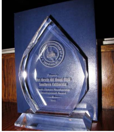
CAL 4 Wheel Drive, new member award